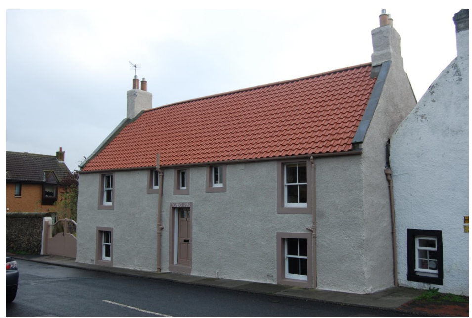
Cottage on Eastgate with marriage lintel over door

The conservation area is largely focused on the historic core of Kinghorn, as defined by 18<sup>th</sup> century buildings. This includes the High Street the main thoroughfare and market place, the Nethergate leading to the central harbour, and the largely residential areas to the north, known as Eastgate, Townhead and North Overgate. The latter's counterpart, South Overgate, whilst originally part of this period, was totally cleared and redeveloped in the 1960's and is therefore excluded. Included however, is a small area of later Victorian residential development known as Kilcruik Road, situated north west of Townhead.