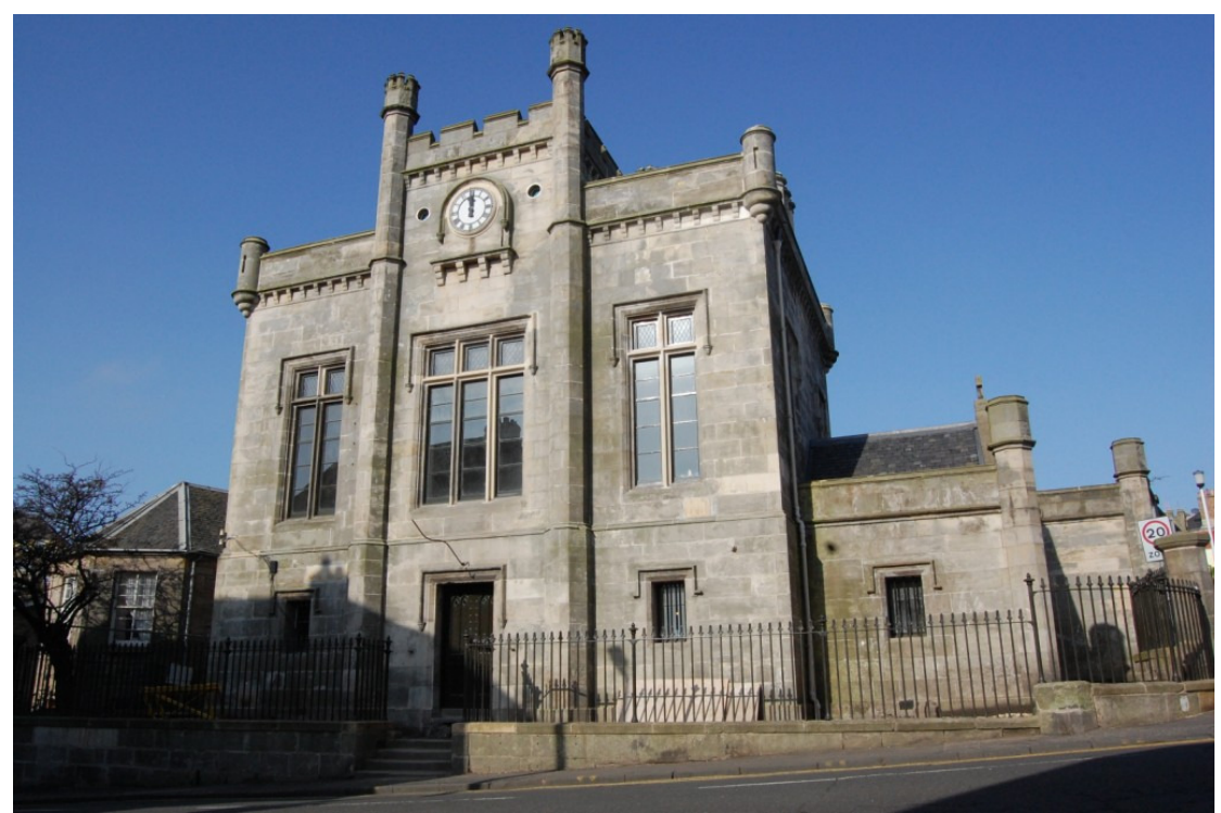
Kinghorn Town Hall following restoration