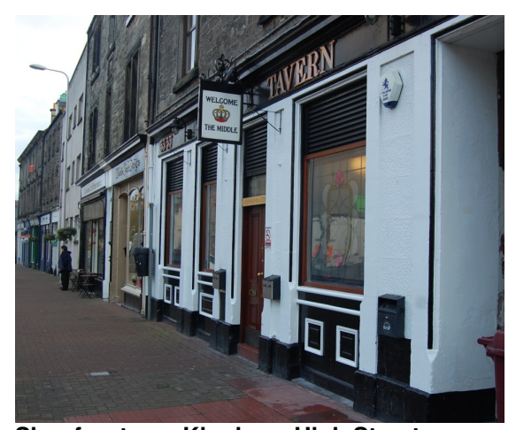
Shopfronts on Kinghorn High Street