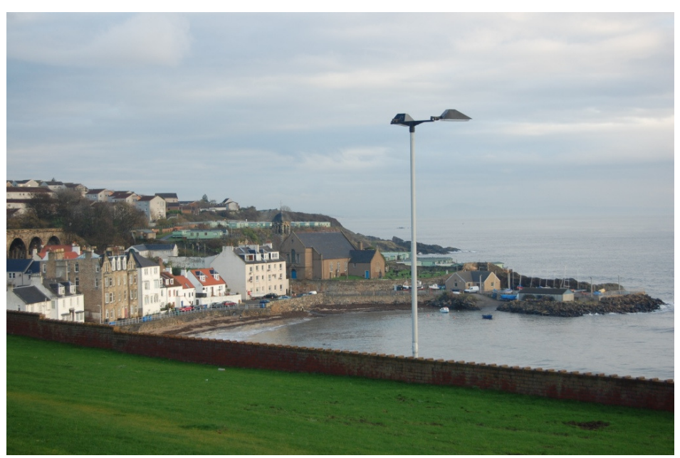
The Harbour and St James Place

Fife Coast Vernacular is the most common style within the conservation area. The properties which constitute this style are primarily domestic, mostly terraced and two storey. The majority were built in the 18<sup>th</sup> century and the surviving examples are mainly located in two areas, the Nethergate/harbour and North Overgate. In both cases the buildings are stepped across the steep contours of the townscape. A sense of urbanity is created both by the terraced development and the continuous building line hard on the heel of the footpath, broken only by narrow wynds or closes and in some cases high random rubble stone walling. This hard