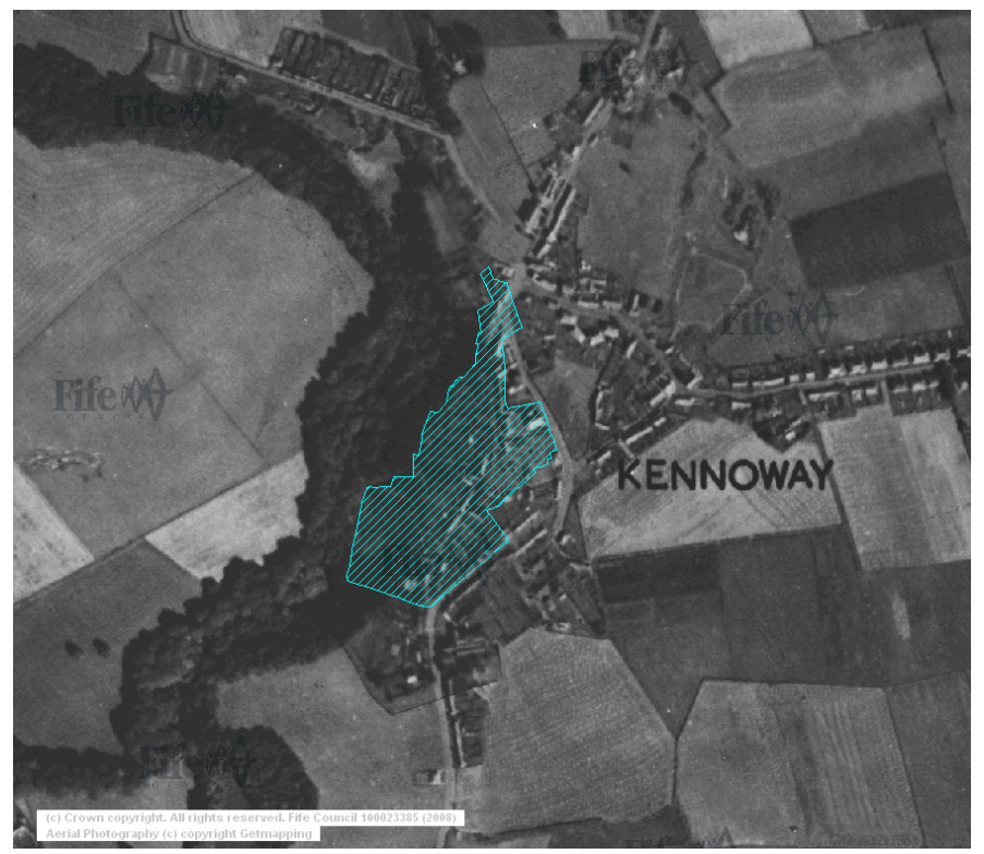
Kennoway from the air in 1940, with The Causeway Conservation Area highlighted in green