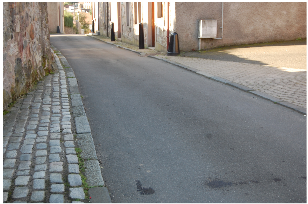
Contrast between setts and concrete block paving on either side of the narrow street