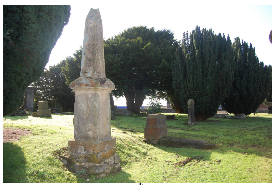
Kennoway's historic 17th century burial ground

As can be seen in the Ordnance Survey map of 1854, the village retained a similar form from that point until the 1940s, when development began to the east. The significance of the conservation area lies in the Causeway's survival as an indication of an older phase of settlement here, including its historic parish burial ground and several fine examples of Fife's vernacular architecture.