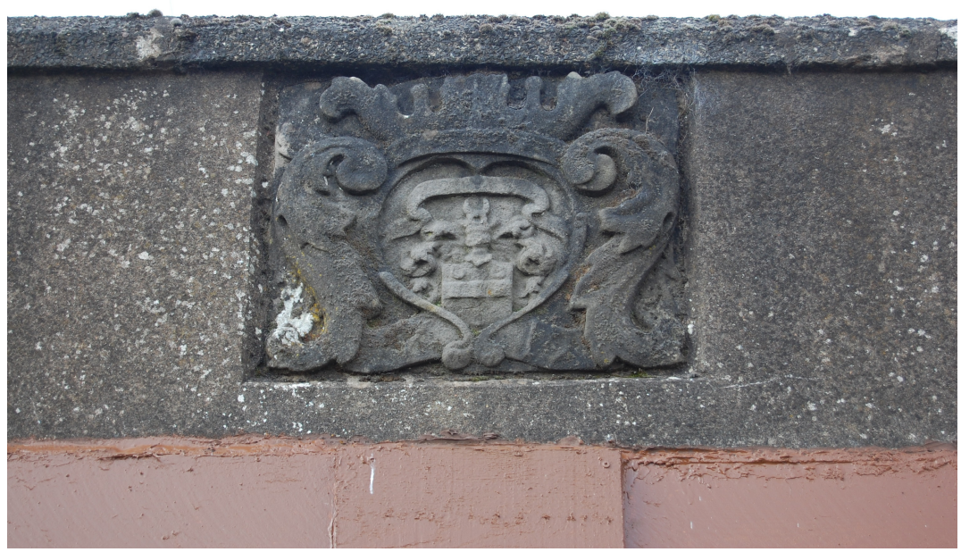
A coat of arms set into a garage on the west side of the Causeway

The social history relating to individual buildings serves to add to the significance of the conservation area with, for example, Seton House being of particular interest. Small architectural details such as skewputts also contribute to the Causeway's character.