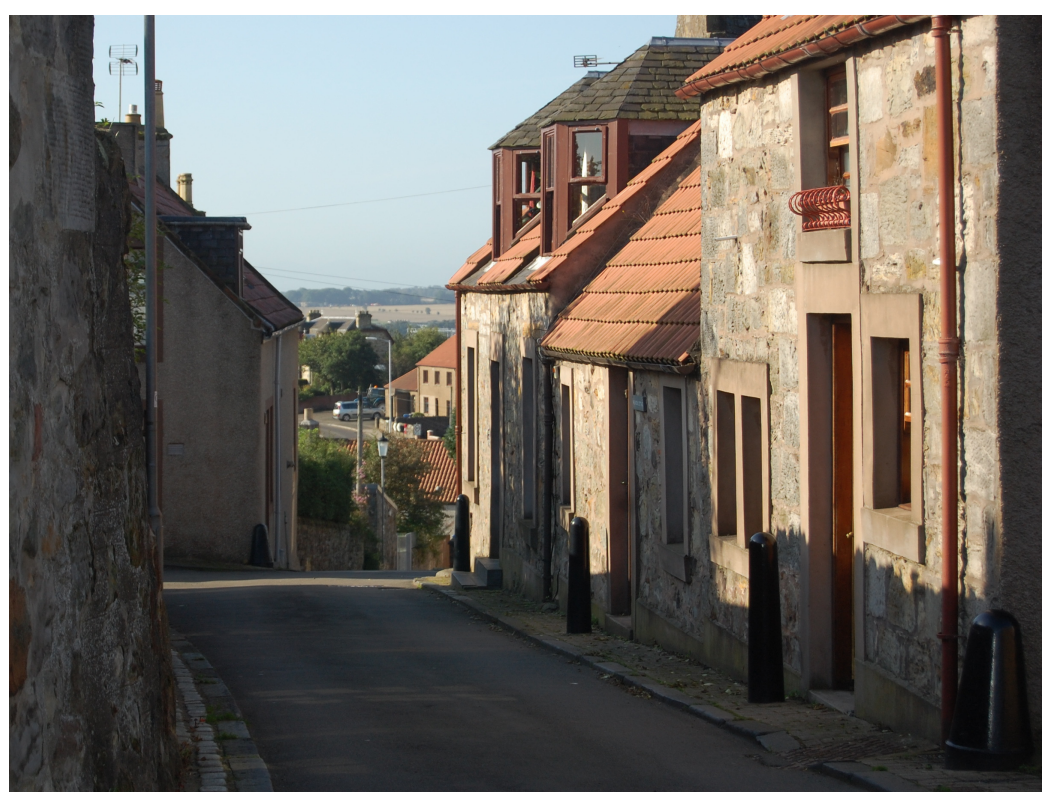
The view south towards the Firth of Forth

The entire parish slopes from the south ascending to the north. The Causeway is the one street contained within the boundary of the conservation area, and is identifiable as the original core of the village.