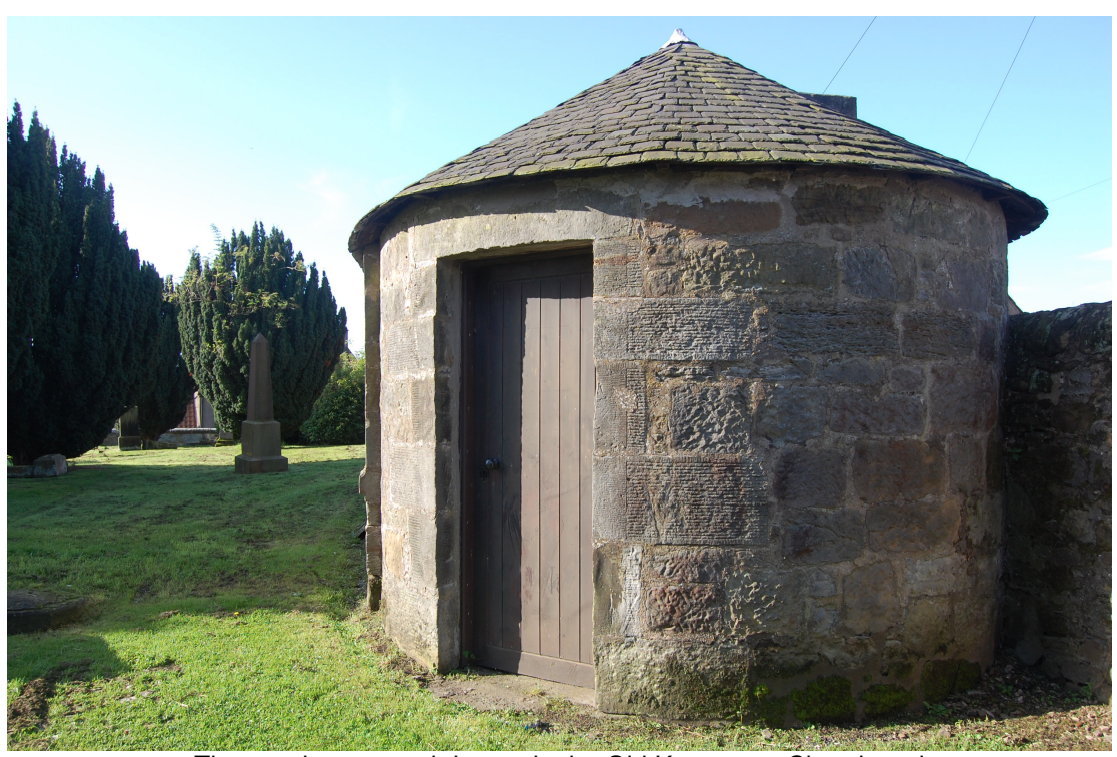
The session or watch house in the Old Kennoway Churchyard

examples of local vernacular are C(S) listed. The B-listed Seton House with its imposing buttress is thought to have been the dower house of Blackhall Castle, and the town house of Captain Robert Seton of Drummaird. Also category B listed, the Old Kennoway churchyard dates from the 17<sup>th</sup> century and contains a number of early memorial stones as well as a small session house of 1835.