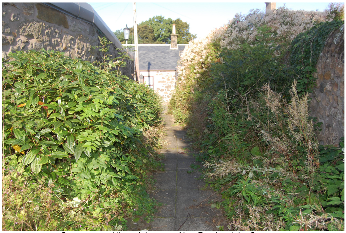
Overgrown public path between New Road and the Causeway