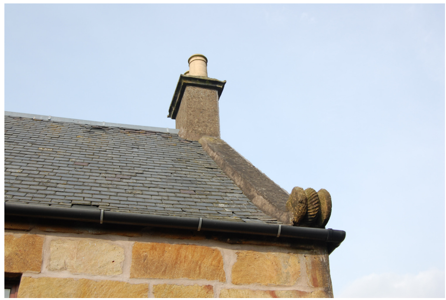
An example in Kennoway of a cable scrolled skewputt, a feature of some of Fife's vernacular buildings