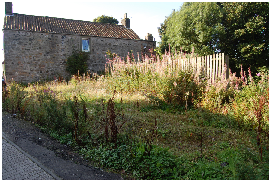
Gap site at northern end of the Causeway