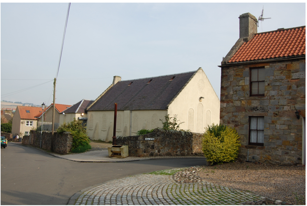
Church Hall at Hall Wynd

The Swan Hotel is currently on the Buildings at Risk Register. It is unlisted, but of architectural merit. In extremely poor repair, its prominent position at one end of the Causeway has a negative impact on the area as a whole when, if it were adequately repaired and maintained, it could provide an attractive focal point.