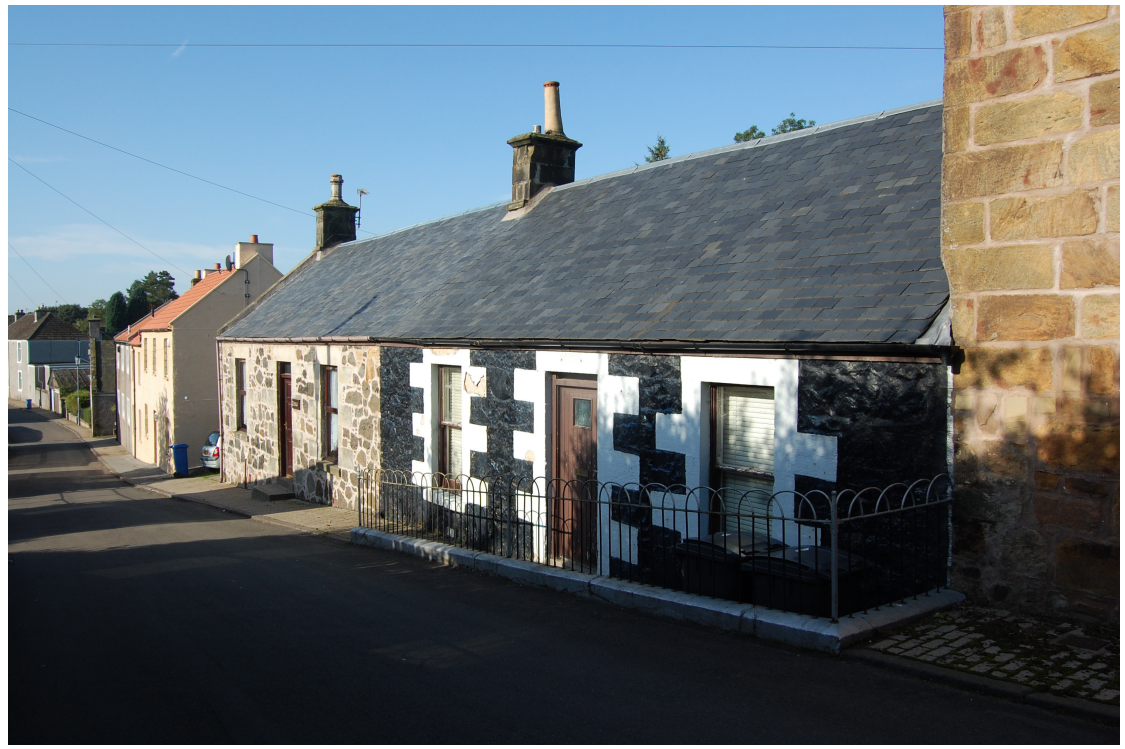
Variation in treatment of terraced whinstone cottages

in buildings of a similar date in nearby Leslie, where two quarries to the north of the town provided whinstone for construction.