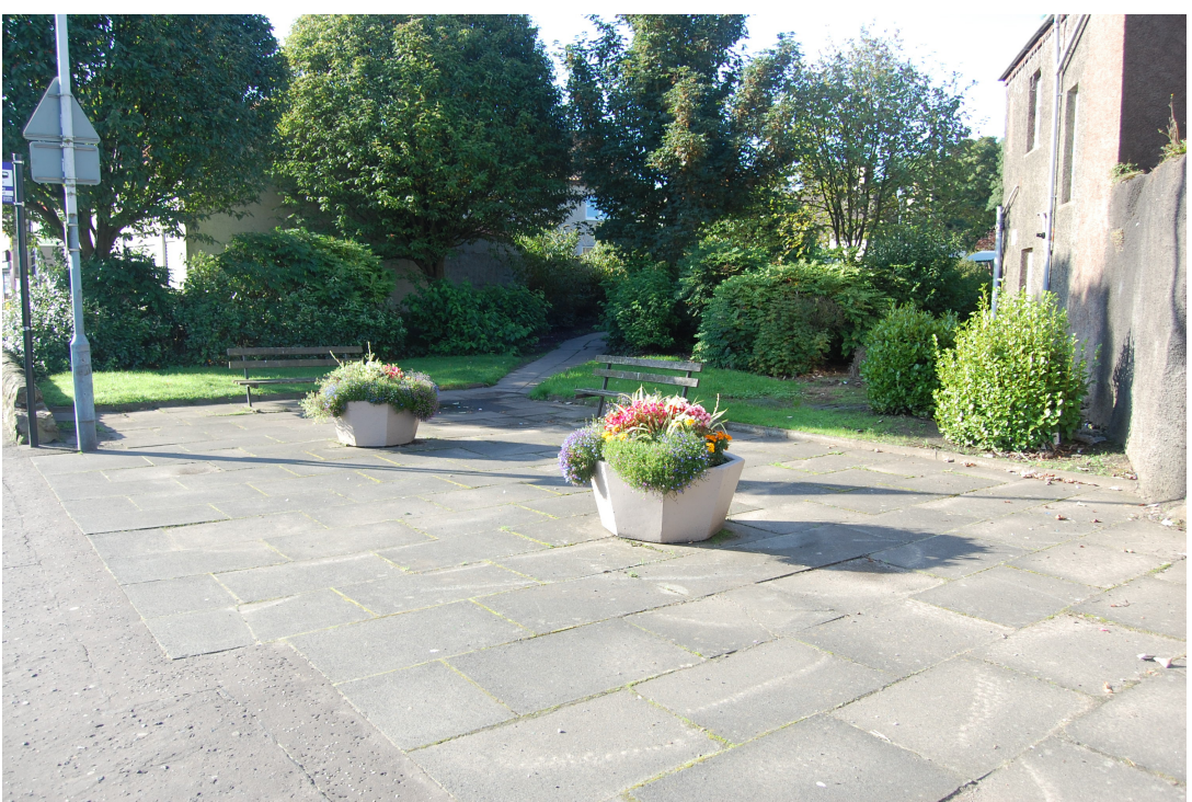
Seating area on New Road

Some additional paths and wynds between the Causeway and New Road are overgrown and in generally poor repair.