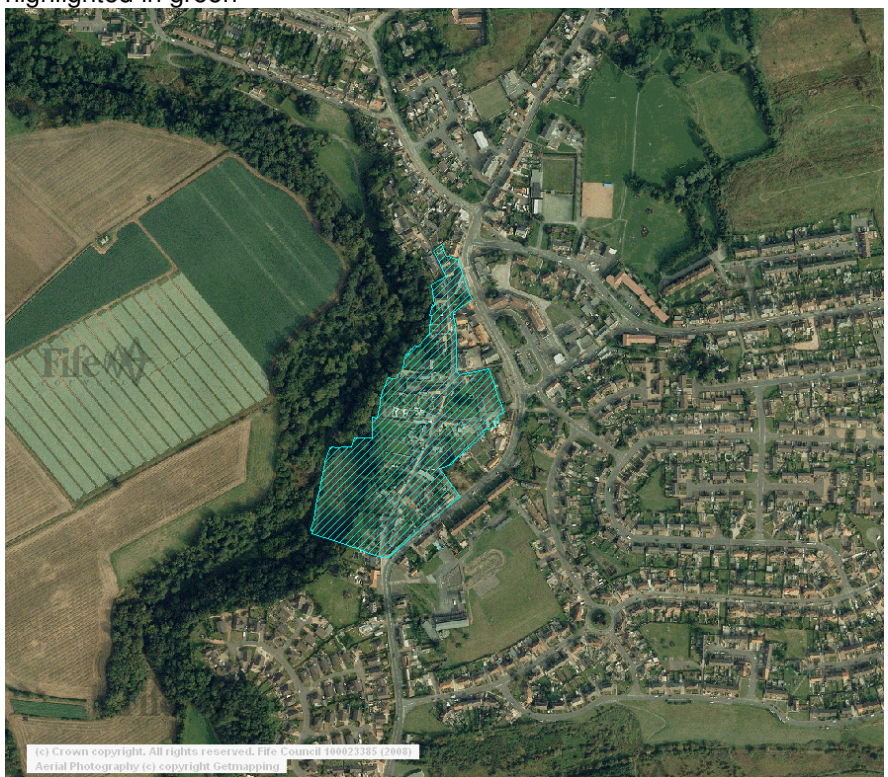
The conservation area in 2006, showing how development has encroached on three sides

Deterioration of the environment around the Causeway appears to have begun around the start of the 20<sup>th</sup> century, accelerating along with the rapid-post war development of the surrounding area. The change in function from a self-supporting, agriculturally based settlement to a dormitory area dominated