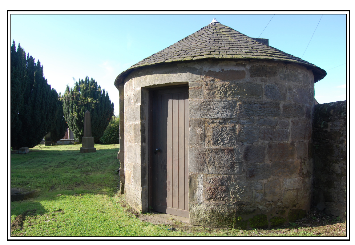
The Causeway, Kennoway Conservation Area Appraisal and Management Plan