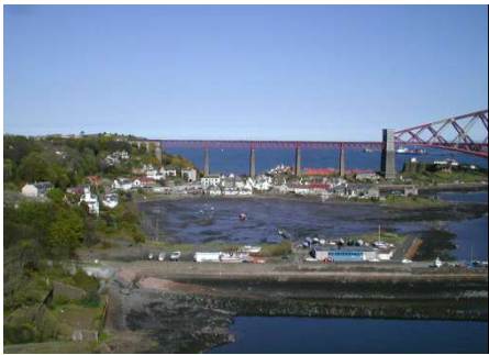
Foreshore area, West Bay