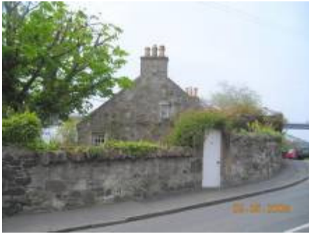
Seabank Cottage, Ferry Road