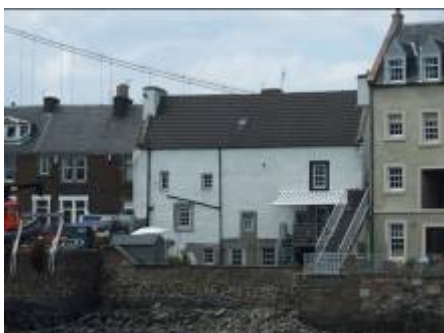
Pierhead House, Main Street

bay traditional house which forms Ivy Cottage at 18 Main Street incorporates many later additions and alterations, most recently by Watson Burnett Architects in 1990. Although complicated in plan and elevation, this is a versatile adaptation of smaller buildings (including a former stable) to form a larger dwelling house. Ivy Cottage forms an integral part of the 18th century village townscape. Evidence of blocked openings to right south elevation was found in earlier photographs.