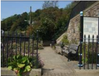
The Brae seating area

Modern materials creeping into more frequent usage include concrete block paviors, concrete slabs and pre-cast concrete kerbs. Traditional materials have been used extensively in recent conservation projects albeit in non-traditional forms. The use of Yorkstone paving on the Battery Road seating area with traditional railings and bollards and more modern curved benches enhances the environment significantly. Other areas improved in