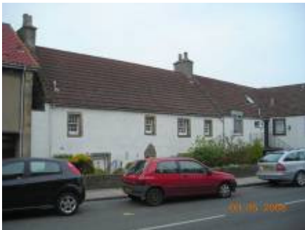
Black Cat Inn, 26-28 Main Street

An outline of each is provided below. Please note that the information contained within this section has mainly been extracted from the Statutory Listing descriptions for each of the buildings featured.