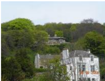
Pump and Plaque , The Brae