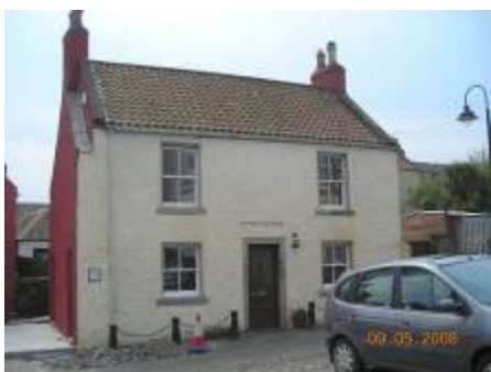
10 Post Office Lane

Post Medieval to Early Modern – the conservation area contains some very fine examples of 18 th and 19 th century buildings and structures, many of which are highlighted below.