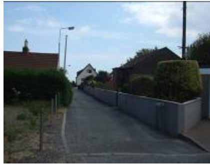
Looking east along Helen Lane