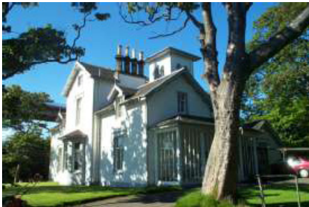
Craigdhu, Ferry Road