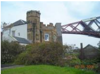
Signal House, Pierhead

conducting business connected with the ferry passage on the first floor. The Signal House was also used for the purpose of a light-house. The existing light room on the existing tower at the head of the pier was built in 1817 by Robert Stevenson having been transferred from the top of the Signal House built in 1812. John Rennie built the Signal House itself and probably co-operated with Robert Stevenson on preparation work for the light room installation. In 1817 this may also have been the case for the transfer to the purpose built tower at the pierhead. The reason for the transfer was the original position confused the ferryboats in navigating towards the pier and also did not act as illumination for the pier itself. Stevenson also designed the twin tower on the Hawes pier in 1812 for exactly the same reason.