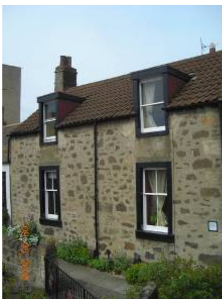
Heron House, Helen Place