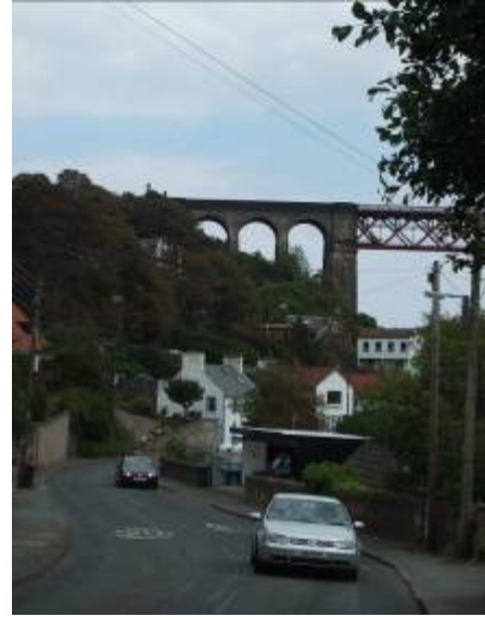
Main road into North Queensferry