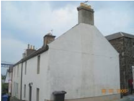
10, 14 Main Street