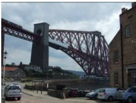
Looking south east along Battery Road