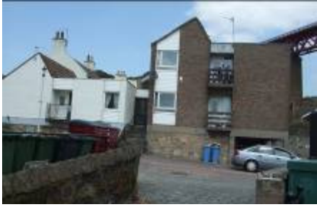
Battery Road – poorly maintained public realm and inappropriate infill developments within the historic core