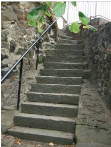
Steps to Willies Well

Within the village envelope there are public routes and paths at the Piggery Steps and Helen's Lane and Helen's Place to Battery Yard, at Willie's Well, at Sylvester's Close (recently re-named Charles Black Close) and the old Black Cat Inn to the foreshore and to Ferrycraig House. The age and complexity of the settlement inevitably results in very complex land ownership issues. There is, however, agreed access to the majority of the village, the foreshore and to the Coastal Footpath. Because the level of visitors is quite high and being actively encouraged it is considered important to consolidate and protect these route.