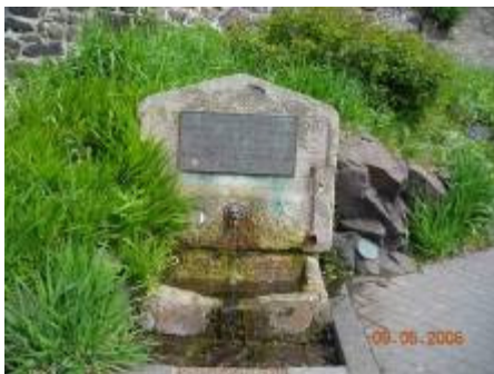
Jubilee Well, The Brae