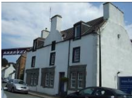
Pierhead House, Main Street