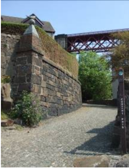
Fife Coastal Footpath