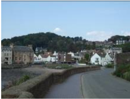
The extent of infill developments within the historic core is evident from Battery Road