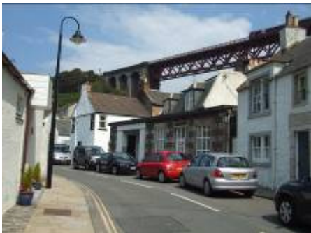
East side, Main Street

The village has a variety of outstanding characteristics which stand alone – such as the Forth Bridge and the various piers and bays which surround the settlement. However, for the sake of simplicity the village can be divided into two separate areas of development the oldest part of the settlement are generally concentrated on the flatter land in the lower village with later expansion seen on higher ground, which is referred to in this document as the upper village . A summary of each of these areas is provided below: