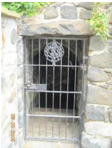
Willie's Well, Main Street

Plaque. The pump is typical of those introduced to the village for supplying Glensherup water from the Ochils, pumped-in from circa 1883. The plaque and stone casing covering an earlier well were probably erected after July 1822 when, according to records of the local Sailor's Society, there was the need to "raise the walls and put a lock on the well." The plaque most likely masks a viewing orifice and appears to have been subject to a locking device, the figures of the foreign sailor and the local woman refer to the days, when in times of drought, the women of the village tried to drive off the crews of vessels in the Firth of Forth who sought to replenish their water stores from an already scanty local supply.