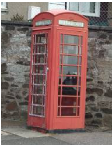
K6 Telephone Kiosk, Main Street

the construction of the bridge commenced in 1883. Remains of tracks in setts (now in disrepair) indicate the site of a former cradle on the East Battery Pier, which would have been used to assist in the construction of the Forth Bridge.