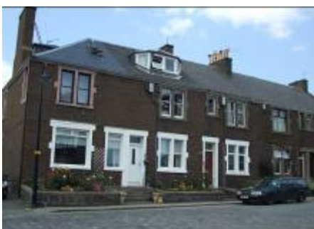
Pierhead Buildings – a variety of window designs and varying types of slate detract from the quality of these buildings