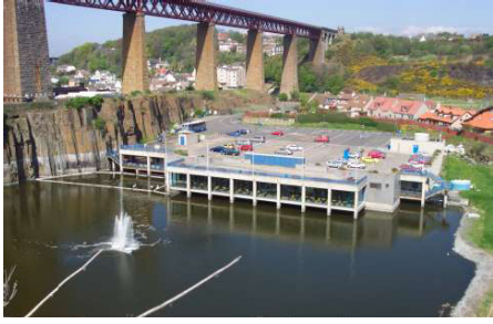
Infilled Battery Quarry – home to Deepsea World since 1994