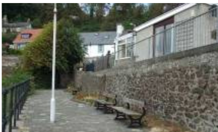
The neglected West Sands seating area