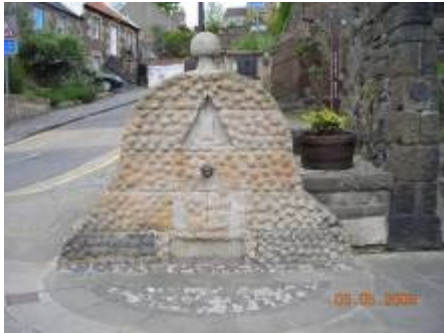
Waterloo Well, The Brae