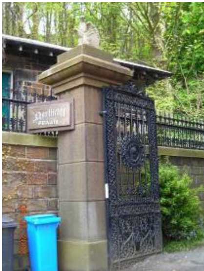
Northcliff, entrance detail

Dunfermline, following acquisition of the land on which it is built from the Ferry Barns estate which was feued in 1837 by the Guildry of Dunfermline. The contemporary L-plan stables, located to the SW of the villa within its boundary walls, have been converted into a cottage dwelling called Craighdu Cottage. Craighdu is best known for the discovery in 1857 of a prehistoric burial mound from which three cists were found measuring circa 12-15m in circumference. The position of the cairn is now thought to have been NW from the main entrance of the house.