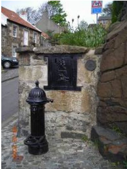
Pump and Plaque , The Brae