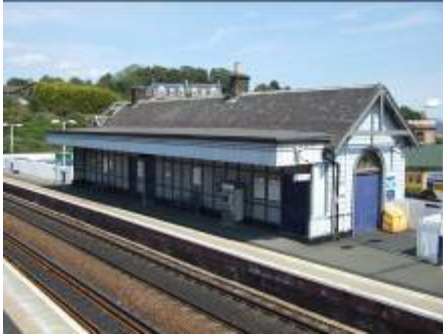
North Queensferry Station