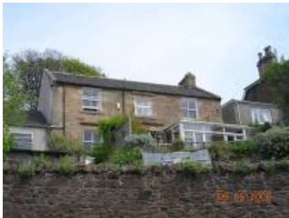
Old School House, The Brae