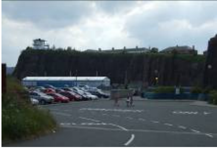
Looking south towards Castlehill, across Deepsea World carpark entrance