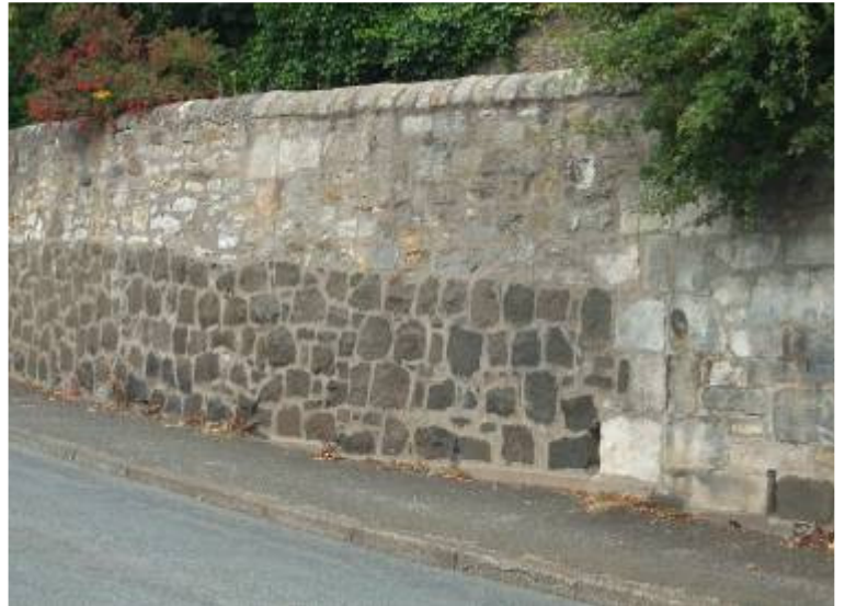
Retaining wall along the B981