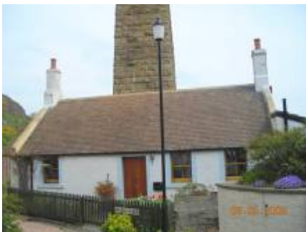
Melinkie Cottage, Helen Place

Medieval Development - very little medieval development survives, what remains is to be found in the lower part of the village at St James' Chapel , which is a Scheduled Ancient Monument dating from the 12/13 th century (see page 7).