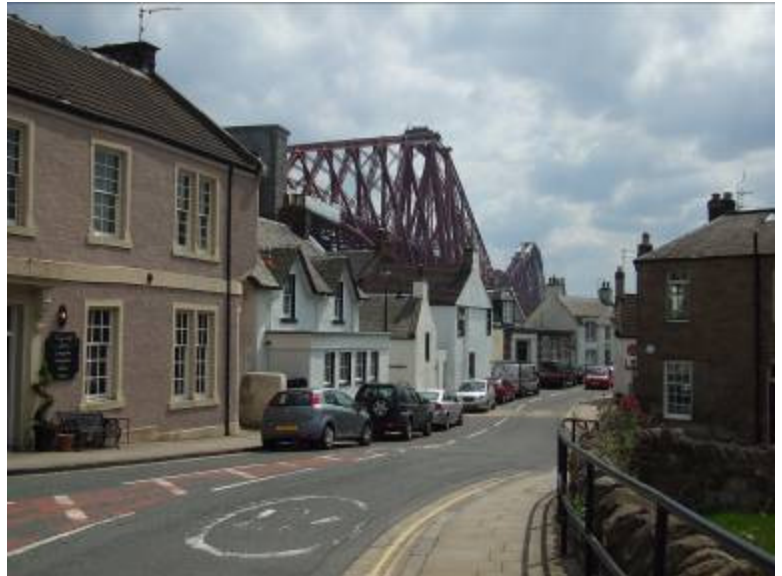
Looking south along Main Street

It is not intended to restrict new development within the boundary of a conservation area, but rather to provide a positive service by way of guidance and example so that any new development integrates successfully with the existing landscape and architectural form. A written description of the North Queensferry Outstanding Conservation Area Boundaries and a schedule of properties within the boundaries are included in Appendix 1.