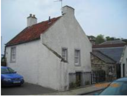
Ivy Cottage, 18 Main Street