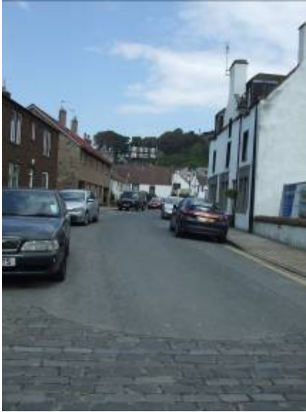
Looking north up Main Street from the head of Town Pier

The historic nucleus of the village is concentrated around the head of South bay on low lying ground. On the north side the land steeply rises up to the Ferry Hills and Castlehill to the east. The natural topography of the site constrained growth of the early settlement, with Castlehill to the south and east, St James' Bay to the east and to the west, West Bay. The small, terraced gardens which are visible to the head of South Bay are a reminder of the exposed rock setting.