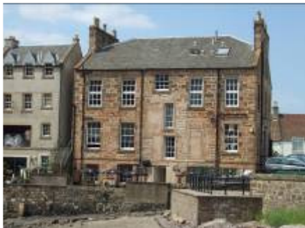
The Albert Hotel, 25 Main Street