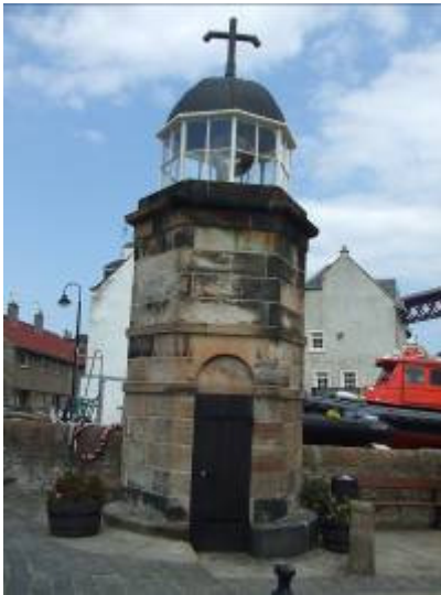
Lantern Tower, Pierhead