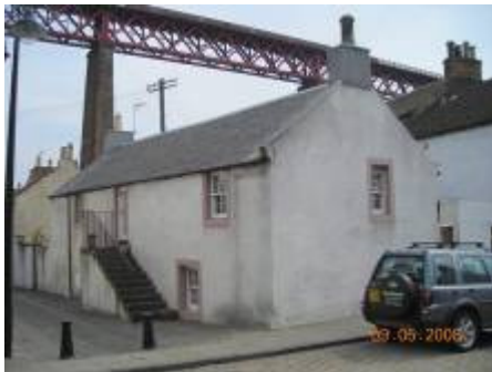
2 Post Office Lane