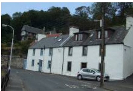
Brae House & White House

1827 as the new school house for the children of North Queensferry as the former school at Melinkie Cottage, in use since 1769, was too small. The new building was a combined school and schoolhouse and was paid for by public subscription. When first built, this school was the last building in the village on the Ferryhills Road. It was used until 1875 when the children were moved to a new building (now demolished) adjoining to the west at which time the 1827 school was used entirely as the school master's residence. The west gable was reconstructed as a plain elevation when the 1876 school was demolished.