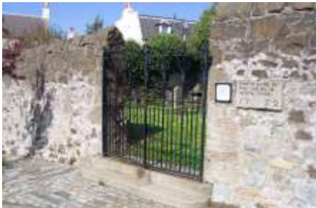
Remains of St James' Chapel

The chapel was established in connection with the ferry across the Forth, with the date of its original foundation being unknown. The chapel is thought to have been destroyed by Cromwell's troops after the battle of Inverkeithing in 1651. A wall was built around the remains of the chapel and the burial ground when it passed to the North Queensferry Sailors' Society in the 18 th century.