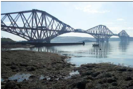
Looking south east across the Forth

The village is situated on the south coast of Fife on a rocky headland which protrudes into the busy sea-lane of the Firth of Forth. The headland on which the village stands forms part of the Midland Valley Sill, a sheet of intrusive rock that underlines much of central Scotland. Exposed sections of it can be seen in road cuttings along the A90 and in the numerous quarries in the local vicinity. In the 1850s there were seven quarries on the North Queensferry peninsula alone. The whinstone (or dolerite) was quarried there to provide slabs, sets and kerbs for use in pavements, roads and harbours.