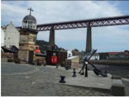
Lantern Tower, Pierhead

the late 1990's include Post Office Lane, Main Street and the Town Pier.