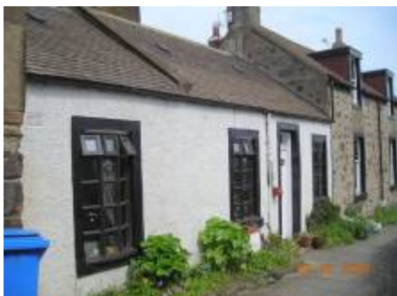
Helen Cottage, Helen Place