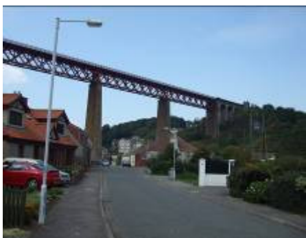
Looking west up Forthside Terrace