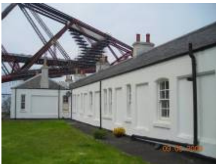
Royal Naval Signal Cottages, Battery Road