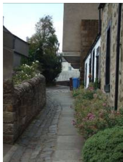
Footpaths at Chapel Place and Helen