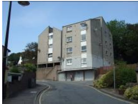
Flats on Old Kirk Road – satellite dishes, an over scaled building generally lacking in build quality and character

lack of cohesion exists with a variety in quality and style of lighting, paving street furniture being used which detracts from the overall impact of the area.