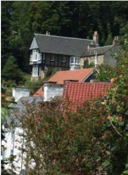
Varying roof heights