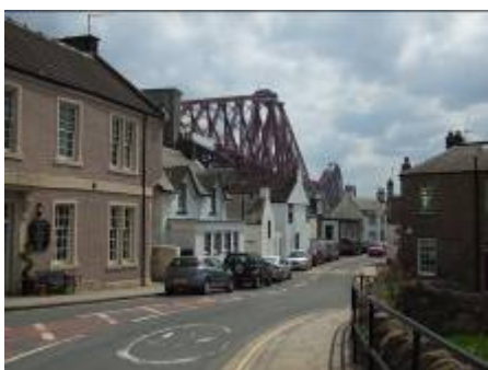
Looking south east along Main Street