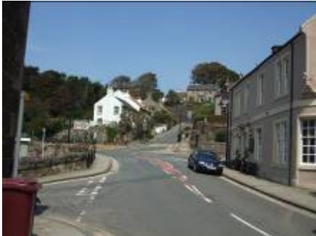
Junction of Main Street and The Brae

To the east of the village, beneath the site of the battery, the land has been designated as a Site of Special Scientific Interest (SSSI) as one of the few remaining calcareous grasslands in Fife, which supports plant species more usually found in the south of Britain. On the hilltop there is a patch of heath land dominated by bell heather which is particularly unusual. The variety of herb-rich as well as tall, neutral grassland areas support a diverse site in which can be identified a number of regional and national rarities. Carlingnose is a particularly