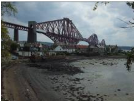
The Forth Rail Bridge