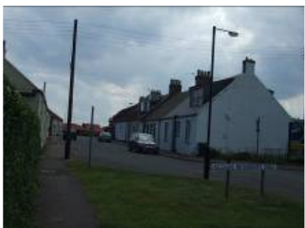
Looking east along Forthside Terrace

include tight urban form, with many areas only accessible by foot. Garden ground tends to be limited, with developments from various periods tightly packed into the limited space available – especially around the remains of St James' Chapel most likely the heart of the medieval settlement. It also functions to a degree as the commercial centre of the village (there are two hotels and a limited number of other small businesses operating there). Moving south along Battery Road the ground begins to rise, leading to the Battery Road car park and further along up to Castlehill the site of the Royal Naval Signal Cottages. Nestled below on the south side are the remains of the West and East Battery Piers, and to the north side is situated the former Battery Quarry now home to Deepsea World Sealife Centre.