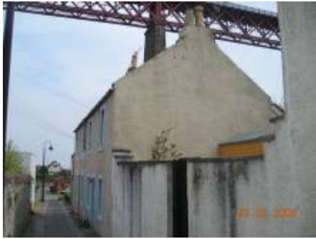
4,6 Post Office Lane