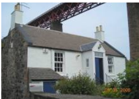
Fourteen Falls, Chapel Place