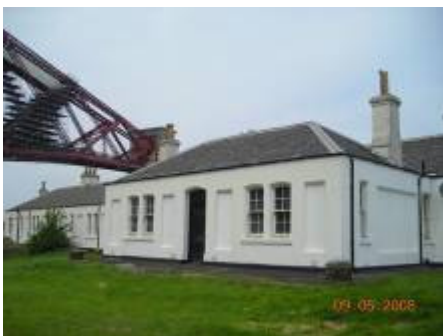
Royal Naval Signal Cottages, Battery Road

Company) at Inverkeithing. The station at North Queensferry forms part of the North Approach Railway and was built as part of the Forth Bridge construction master plan. The North Approach Railway is just over 3km in length commencing from the abutment at the north end of the Forth Bridge and terminating at Inverkeithing at the former junction with the North British Railway. The northern approach also includes the large viaduct at Jamestown. In the late 1980s, the remaining station building was closed and the platform window openings boarded up. It now operates as an unmanned station.