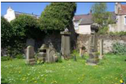
Remains of St James' Chapel