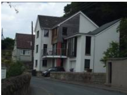
Modern houses on Main Road