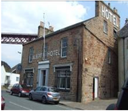
The Albert Hotel, 25 Main Street