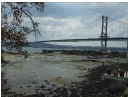
The Forth Bridge