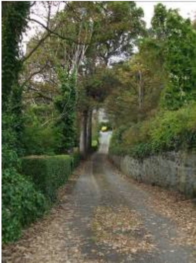
Private drive to Hill House