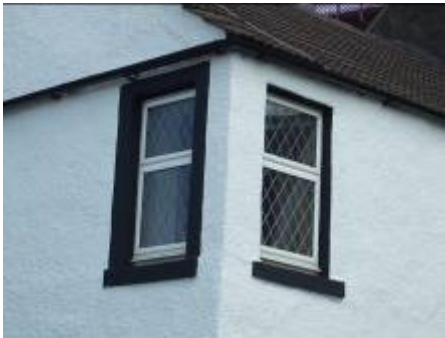
An example of an inappropriate windows and roofing tiles seen on an historic building within the historic core