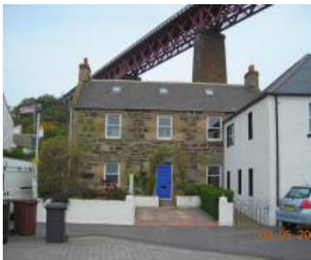
The Old Jail, Battery Road