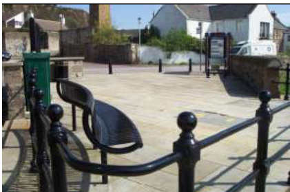
Battery Road seating area