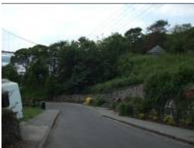
Wooded areas surround the village