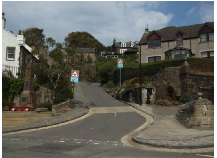
Main Street and The Brae junction