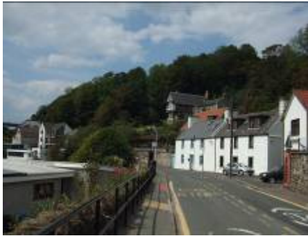
Wooded areas surround the village

good vantage point for watching sea-birds such as skua during the autumn months.