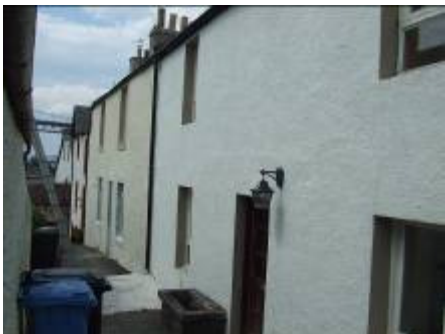
Davidson's Buildings, 10-14 Main Street

The lower village is effectively split in two by the piers of the Forth Bridge which dominate the setting of this part of the village. These two sections of the lower village fall to the east and west, as outlined below.