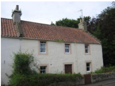
May Cottage, Smiddy Burn

The dominant construction material for buildings and boundary walls is blonde sandstone, either as