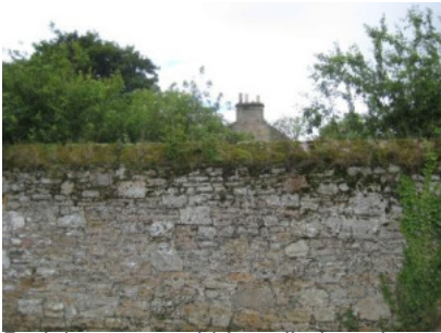
Parish manse rubble walled garden