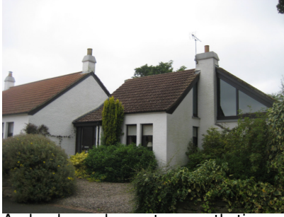
A clearly modern yet sympathetic addition to an unlisted mid-19 th century cottage in Lady Wynd

Within the conservation area, away from the main groups of listed buildings and especially within the groups of modern houses there have been many alterations and additions usually controlled through the Article 4 Direction. This is particularly evident at 30-38 Seagate, a row of early 19 th century cottages which although un-listed are typical of the conservation area and add much to its character. In addition to non-traditional replacement windows and doors No.38 has had windows completely changed and a flat roofed extension added, all united by modern cement white painted render. The combined effect not only destroys the unity of the row of cottages but introduces totally alien architectural elements to the conservation area.