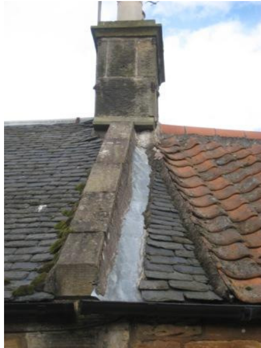
Use of slates at skew of an originally thatched roof