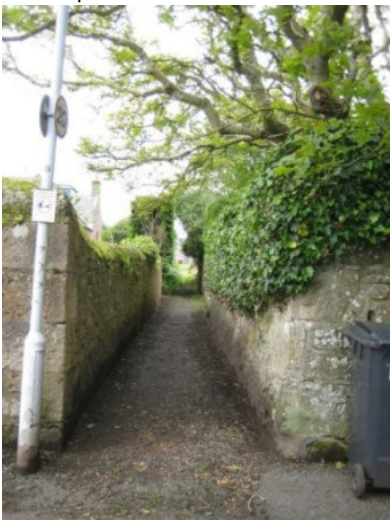
Private footpath between Bell's Wynd and Smiddy Burn – shown on 1854 OS map

this basic settlement pattern except the northern policy wall to Cambo House and parallel road leading to the former harbour. These formed a manmade boundary restraining the southward spread of the village. Plots, frontages and building lines are distorted slightly from a strict grid pattern as a result of these features. The street pattern as shown on the Ordnance Survey 1 st Edition map has groups of buildings around each farm, with easy access to the farms and the surrounding countryside. The church, dating from the 17 th century, is located in the centre; and together with the village square and several significant historic buildings, including the original school house, forms the heart of the village. An early 19 th century inn next to the church, fronts the A917 former turnpike road. A large field shares a boundary with the main road and the village square. This brings the agricultural hinterland directly into the historic heart of the village and is a significant character feature.