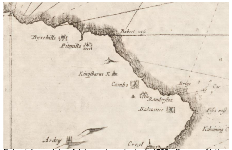
Extract from John Adair marine chart of 1703. Note Boarhills (Kenly Green House) ‘Byrehills’; Pitmilly House, ‘Pitmillo’ and Kingsbarns kirk; Kingsbarns Law with tower and Cambo House.

Kingsbarns originally developed round three ‘fermtouns’. Fermtouns were largely self-sufficient, subsistence level, farm settlements with the land held on a communal runrig system. This system disappeared following the 18 th century and subsequent 19 th century agricultural improvements, which saw the fermtouns replaced by the steadings