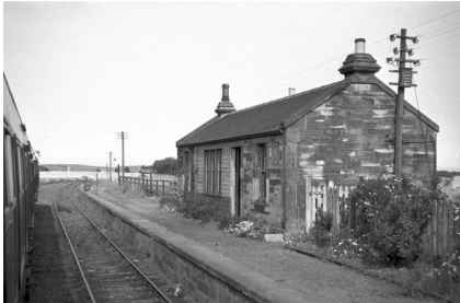
Above Kingsbarns railway station and waiting rooms before closure in 1930

principle crops grain and potatoes; the local stone freestone, ironstone, limestone and occasionally black marble.