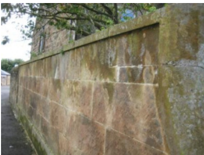
Kingsbarns House ashlar masonry