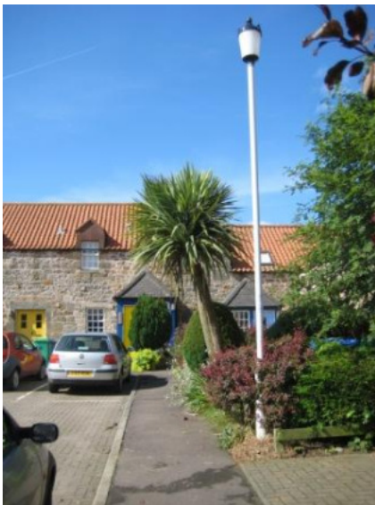
Residential steading conversion South Quarter Farm.

The second is a collection of buildings; the remaining part of the category C listed early 19 th century North Quarter steading after the northern section was converted to residential use. This important remnant consists of largely unaltered, connected steading buildings which include the former threshing mill and cart sheds. These buildings represent the last remnants of the original farms which were highly significant in the history and development of the village.