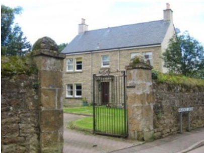
Former South Quarter farm steading yard gate posts and walls

rubble or ashlar. Relatively few buildings are rendered, almost all with cement and painted with modern masonry paint. Woodside Cottage, Back Stile however is a good example of the recent use of the traditional lime harl and wash which would in the past have been commonplace.