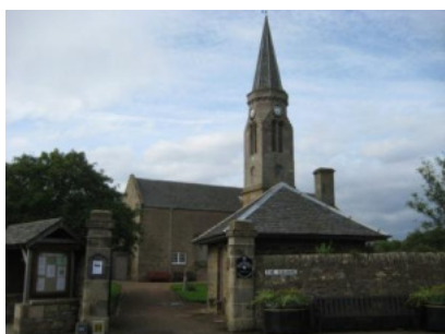
Kingsbarns Parish Church

There are 55 statutory list entries for the conservation area. A high proportion of these (67%) are Category B listed. The remainder are Category C listed. In some cases the listing relates to a number of buildings. In addition to buildings the entries cover items such as the drinking fountain in the square and a sepulchral monument in the graveyard. Appendix 2 of this appraisal provides descriptions and photographs of all listed buildings and structures in the conservation area all of which are of historic or architectural importance. The following are identified as particularly significant: