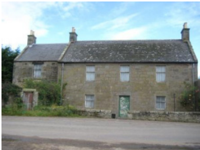
South Quarterfarm house, Back Stile

Provides a focal point ending the view west down Seagate.