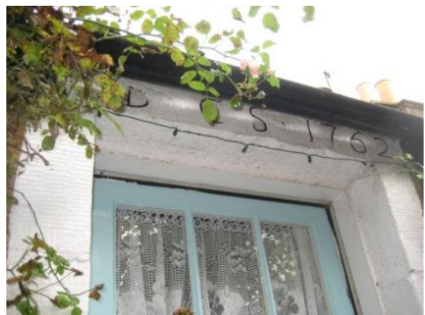
Dated window lintel in Lady Wynd