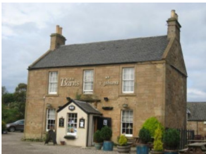
The Barns, Main Street