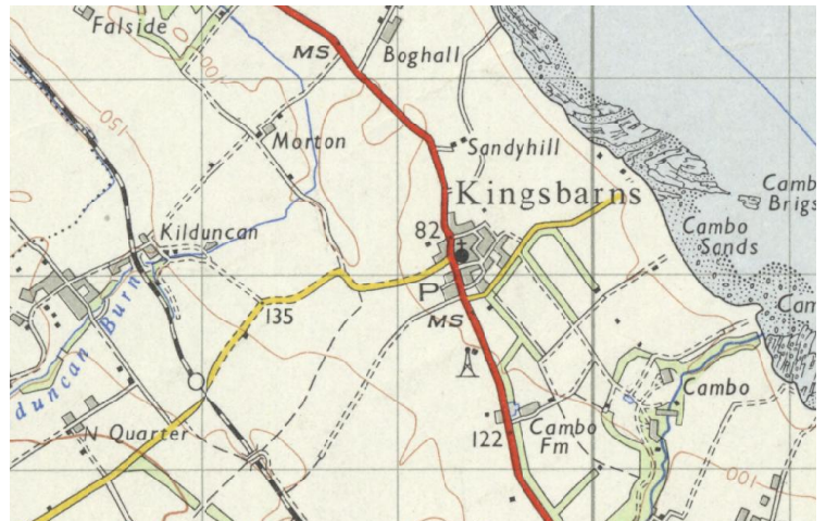
Ordnance Survey 1957. Note Kingsbarns railway station 1km to the SW of village.

Kingsbarns railway station was opened in 1883 and operated until 1930 when it closed as a passenger station. It continued on in use as late as the 1950s serving the village's three arable and dairy farms, transporting items such as cattle in to fatten and potatoes and sugar beet out to markets and processing. The line remained open for freight until 1965. Located 1 km to the west of the village, it contributed significantly to the continuing development of the village. The station was initially an intermediate station on the Anstruther and St Andrews Railway, used to transport farm animals and produce to markets such as Dundee or to the slaughterhouse and cattle market in Cupar. The station also provided access to the surrounding country estates for the shooting parties that were popular at the time. It was intended to be the end of the route of the East Fife Central Railway which extended from the Thornton/Methil main line through Kennoway, Montrave, Largoward to Lochty which was the terminus. The station was laid out with two lines to allow joining but in the event this did not take place.