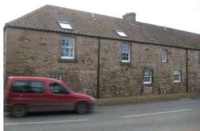
The 'Library' Main Street a former village hall and reading rooms following residential conversion (above). Photograph below shows same elevation prior to conversion – note original pattern of windows and doors.

buildings. As such they are particularly important in defining the historic character of the conservation area. Their destruction or any alterations which diminished their special character would be a major loss.