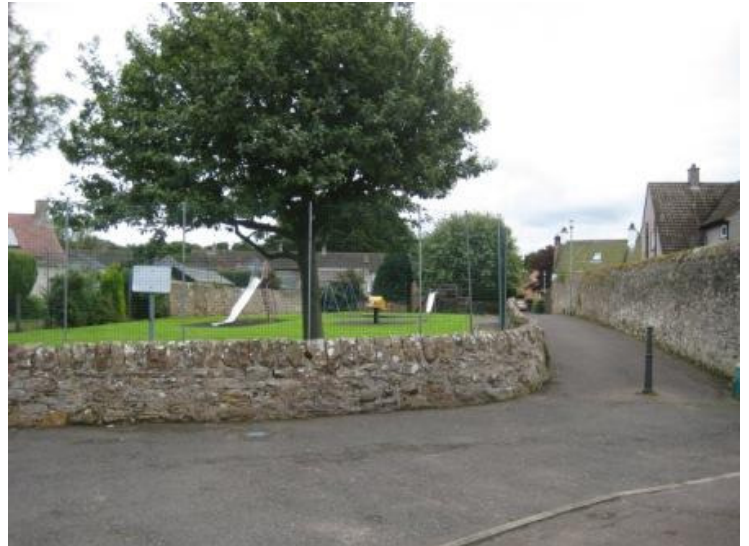
Seagate children's playground