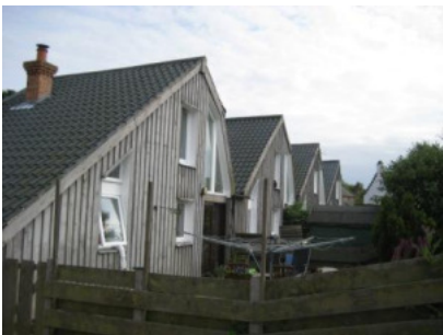
Concrete roof tiles and larch boarding