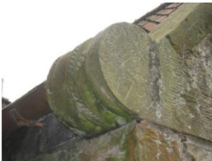
Skew put dated 1792, Smiddy Burn Street