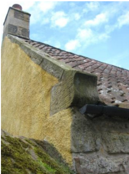
Woodside Cottage traditional lime harling and limewash.

Other examples of inappropriate modern materials used in the conservation area are plastic (PVC-u) soil and vent pipes, sometimes also protruding through the front roof slopes of listed buildings; plastic rainwater goods and concrete roof tiles.