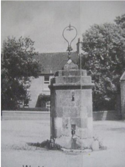
Village pump with original lamp

The historic quality of a conservation area can similarly be diminished by the casual use of ersatz “heritage” furniture from a catalogue.