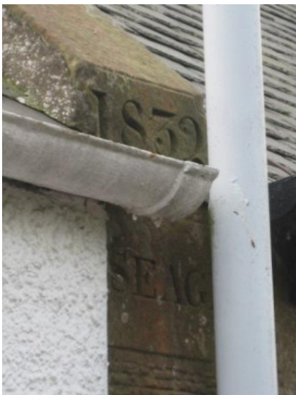
Dated skew put in Seagate

An unusually large number of houses and even the village pump have dated skew puts, lintels or other date stones. There are some sixteen alone on listed buildings. Almost half of these are 18 th century and the rest 19 th century, with dates ranging from 1732 to 1871.