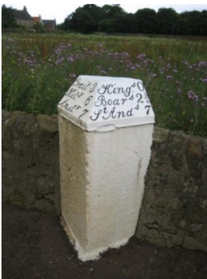
19 th century milestone on A917 former turnpike road