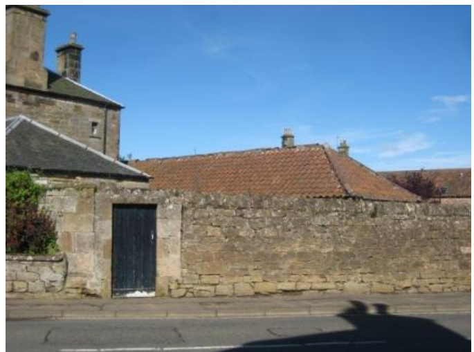
North Quarter steading rubble wall

A distinctive feature of the conservation area is the prevalence of stone boundary walls. Each former farm steading is still enclosed by substantial 2m high sandstone rubble masonry walls with imposing gate piers and, throughout the village, buildings have traditional rubble masonry boundary walls. There are few exceptions to this; these being mainly later additions or to modern developments.