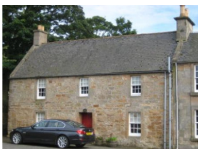
Cesneuk, The Square

A substantial house originally built in mid-18 th century house, reconstructed and extended in the late 18 th century.