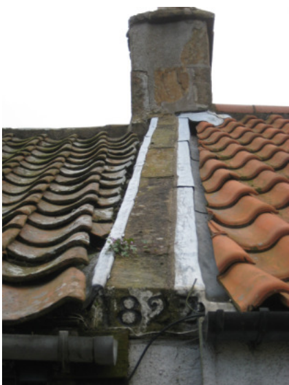
Use of 'secret' lead watergate instead of a traditional lime mortar skew fillet.

A skew which was not at right angles to the roof ridge would not have caused any problem for a thatched roof but now requires tiles to be cut or a slate and tile mix skew detail to accommodate this.