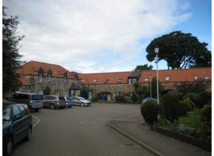
South Quarter Farm - residential steading conversion

to understanding and appreciating the linear patterns of development within a historic burgh, a planned neo-classical suburb or a 20th-century new town. Each place has its own character and its own story to tell.”