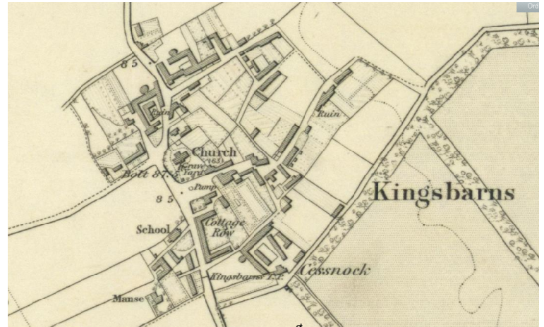
Extract from 1854 Ordnance Survey 1 st Edition

The topography of the conservation area is unremarkable, being level, with no water courses or any other natural features to influence the historic street pattern or character.