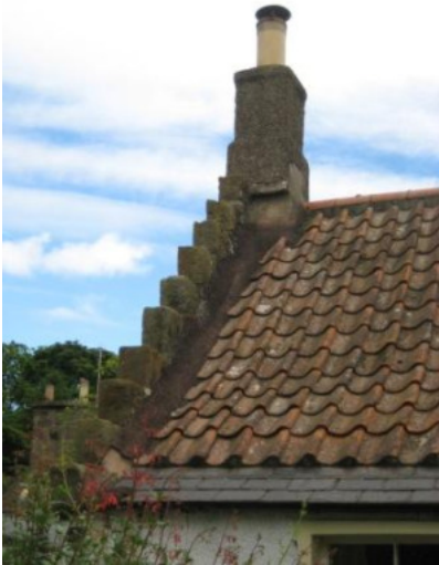
Typical Fife vernacular with corbie gables; slate easing course; pantiles and thackstone