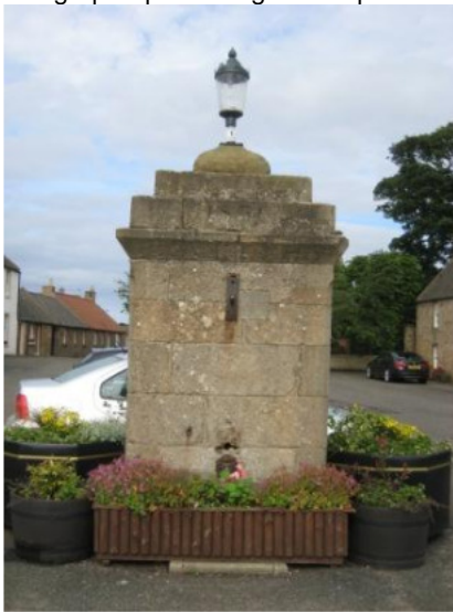
Village pump with replacement lamp

“...there are just as many Boroughs looking to maintain the traditional charm and character of their historic towns. The new ... fits that brief providing an authentic looking waste bin...”