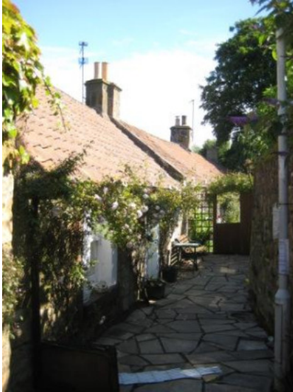
4, 6 and 8 Lady Wynd