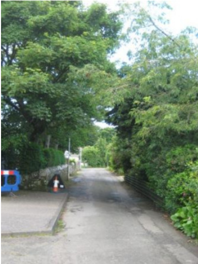
New private road at east end of Seagate serving modern development