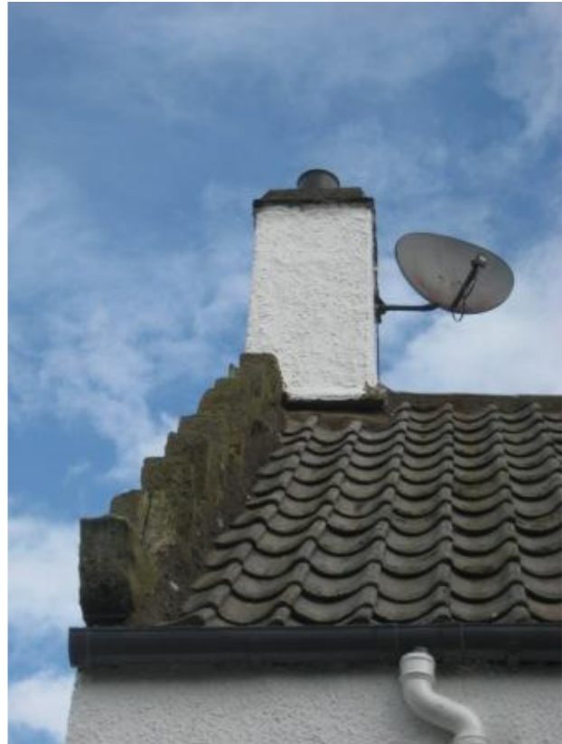
Satellite dish on a category B listed house on Seagate

The introduction of a new architectural feature or addition to a listed building should be avoided if there is no historic precedent or evidence for it. A major extension or addition to a building, or the introduction of a new feature such as a dormer window may harm the special character of the building and the area. On a smaller scale, solar panels, satellite dishes and even TV aerials, which are clearly modern intrusions, diminish the historic character.