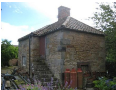
Early 19 th century Category B listed former bakehouse at Torrie House

The 1786 dated, category B listed, South Quarter farmhouse appears vacant and in poor condition although still in a farming related use. The building is particularly significant as a last reminder of the farms which were so important in its historic