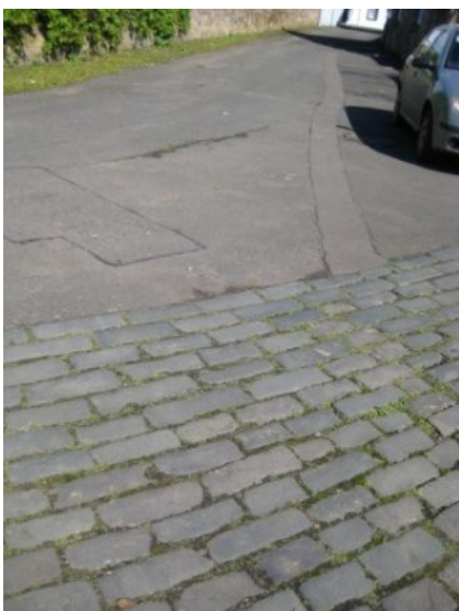
Traditional whin setts at the entrance to a former steading yard

The historic rural character of the conservation area