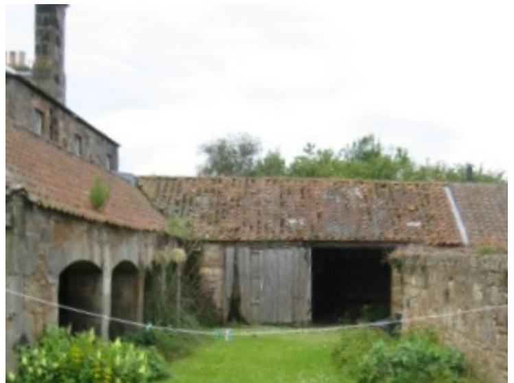
Early 19 th century category C listed former cart shed and barn at North Quarter farm

The second is a collection of buildings; the remaining part of the category C listed early 19 th century North Quarter steading after the northern section was converted to residential use. This important remnant consists of largely unaltered, connected steading buildings which include the former threshing mill and cart sheds. These buildings represent the last remnants of the original farms which were highly significant in the history and development of the village.