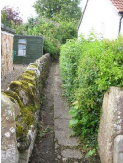
Private footpath between Lady Wynd and the Square – shown on 1854 OS map