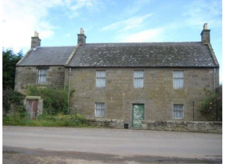
Category B listed 1786 former South Quarter farmhouse

development and in forming the special character of the village.