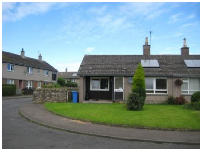
Multiple satellite dishes and solar panels on un-listed modern houses within the conservation area