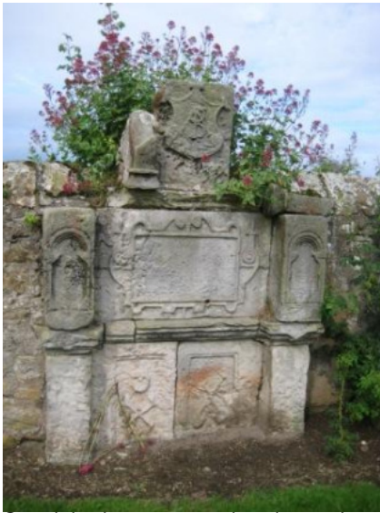
Sepulchral monument dated 1638 in graveyard

Archaeological evidence of past human activity in the area includes a 4,000 year old pot found at Pitmilly and recently (2003) a nationally important rare Pictish Class III Symbol Stone/ Christian cross slab from the 9 th or early 10 th century at Kilduncan. Two bronze age cists were discovered in 1873 at Kingsbarns Law. The first known reference to the parish of Kingsbarns or “Kingis-bemis” is a charter of 1519. The origin of the name Kingsbarns was in reference to the barns which supplied the royal palaces at Crail and Falkland. Although no such buildings survive, to the east of the village at the end of Back Stile are the remains of a harbour and nearby the possible remains of a ‘castle’ with secure store buildings. The harbour’s earliest record is from 1537 when it was used to collect taxes and customs dues for the Burgh of Crail, the parish of Kingsbarns being until 1631 part of Crail.