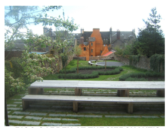
RIGG GARDEN AT THE MERCHANT'S HOUSE

The westernmost part of the area is encompassed by Fife College Priory campus. Much of this well maintained area is covered by mature woodland, with terraced access paths provided from St Mary's Road and retaining walls and formal lawns around the Priory.