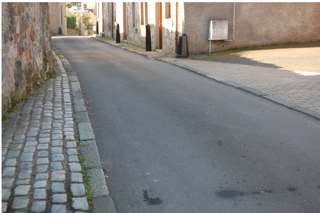
Contrast between setts and concrete block paving on either side of the narrow street