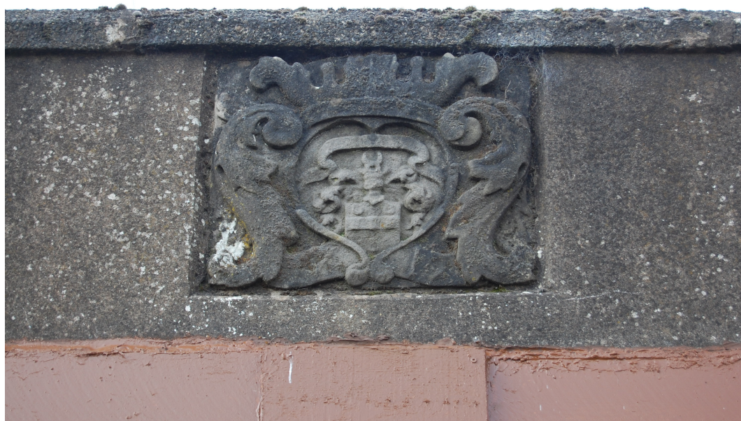
A coat of arms set into a garage on the west side of the Causeway

The social history relating to individual buildings serves to add to the significance of the conservation area with, for example, Seton House being of particular interest. Small architectural details such as skewputts also contribute to the Causeway's character.