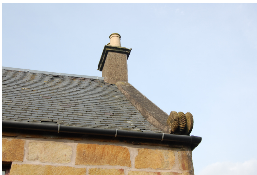
An example in Kennoway of a cable scrolled skewputt, a feature of some of Fife's vernacular buildings