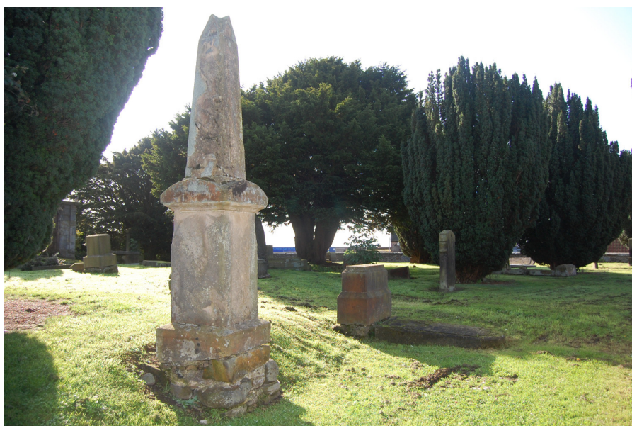
Kennoway's historic 17 th century burial ground

As can be seen in the Ordnance Survey map of 1854, the village retained a similar form from that point until the 1940s, when development began to the east. The significance of the conservation area lies in the Causeway's survival as an indication of an older phase of settlement here, including its historic parish burial ground and several fine examples of Fife's vernacular architecture.