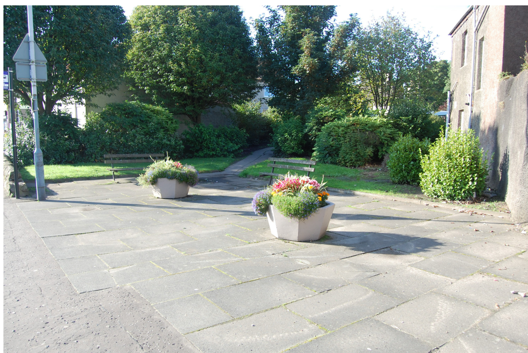
Seating area on New Road

Some additional paths and wynds between the Causeway and New Road are overgrown and in generally poor repair.