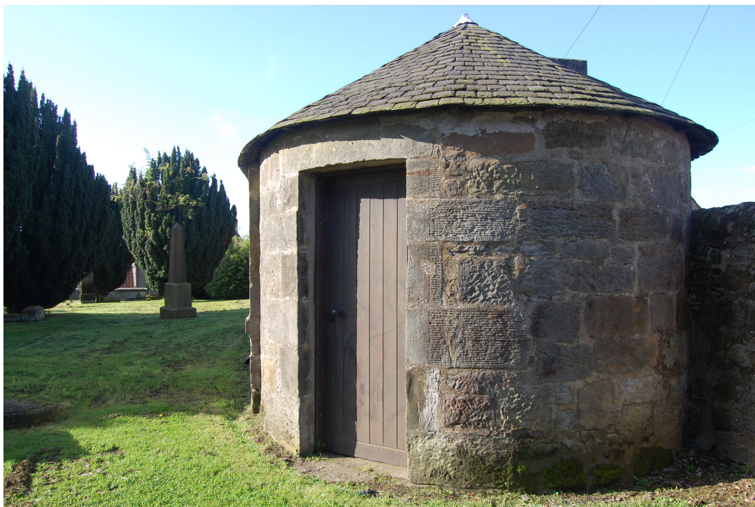
The session or watch house in the Old Kennoway Churchyard

examples of local vernacular are C(S) listed. The B-listed Seton House with its imposing buttress is thought to have been the dower house of Blackhall Castle, and the town house of Captain Robert Seton of Drummaird. Also category B listed, the Old Kennoway churchyard dates from the 17 th century and contains a number of early memorial stones as well as a small session house of 1835.