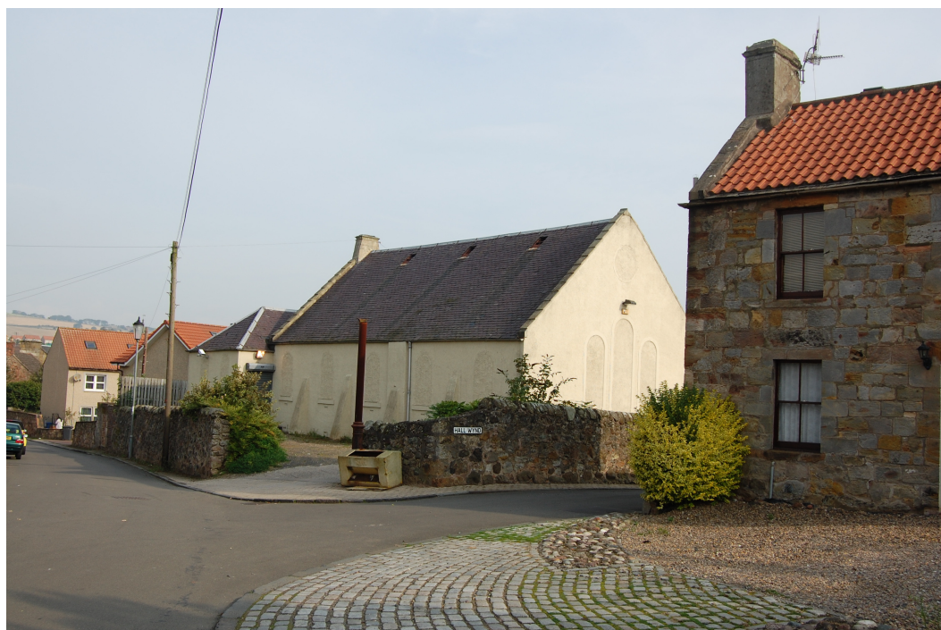
Church Hall at Hall Wynd

The Swan Hotel is currently on the Buildings at Risk Register. It is unlisted, but of architectural merit. In extremely poor repair, its prominent position at one end of the Causeway has a negative impact on the area as a whole when, if it were adequately repaired and maintained, it could provide an attractive focal point.