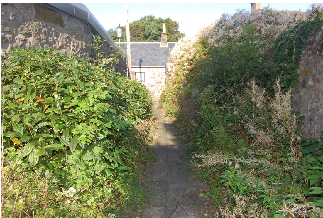
Overgrown public path between New Road and the Causeway