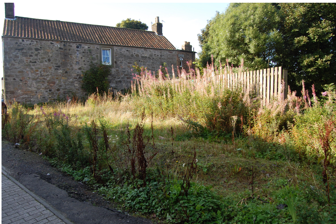
Gap site at northern end of the Causeway