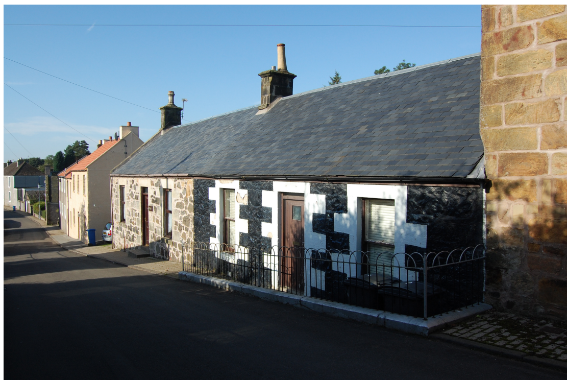
Variation in treatment of terraced whinstone cottages

in buildings of a similar date in nearby Leslie, where two quarries to the north of the town provided whinstone for construction.