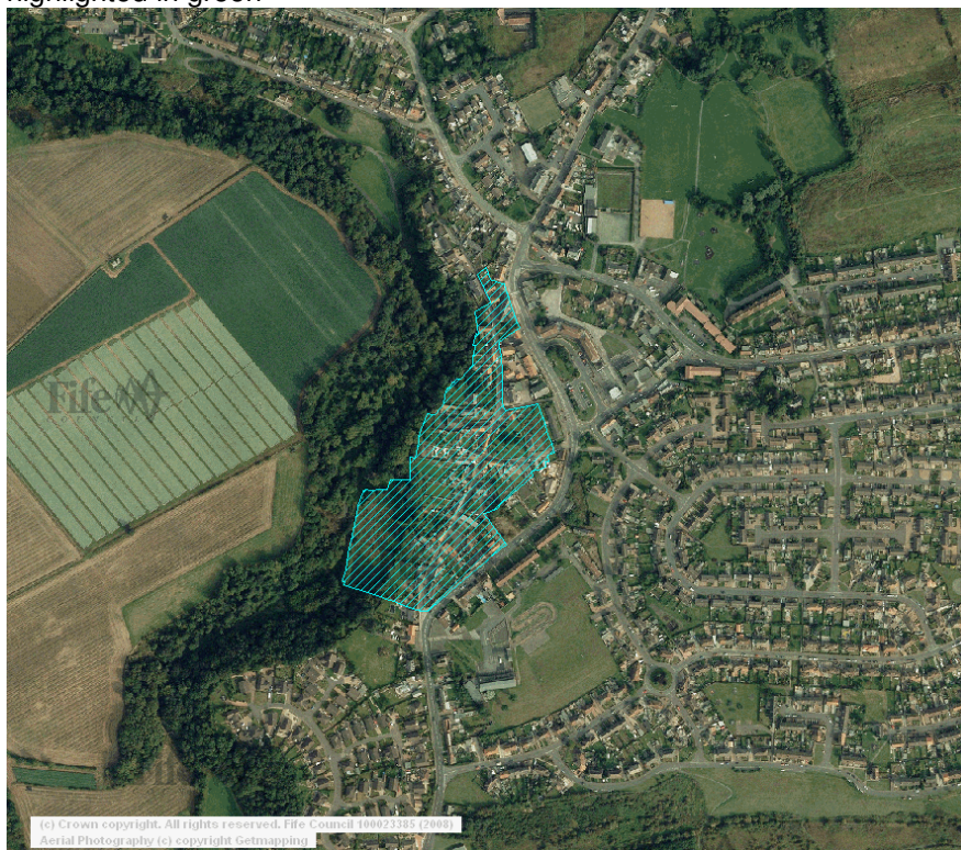
The conservation area in 2006, showing how development has encroached on three sides

Deterioration of the environment around the Causeway appears to have begun around the start of the 20 th century, accelerating along with the rapid-post war development of the surrounding area. The change in function from a self-supporting, agriculturally based settlement to a dormitory area dominated