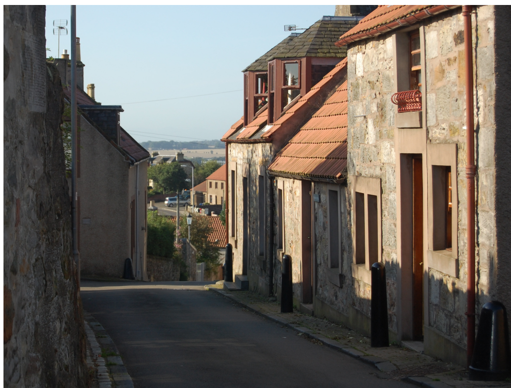
The view south towards the Firth of Forth

The entire parish slopes from the south ascending to the north. The Causeway is the one street contained within the boundary of the conservation area, and is identifiable as the original core of the village.