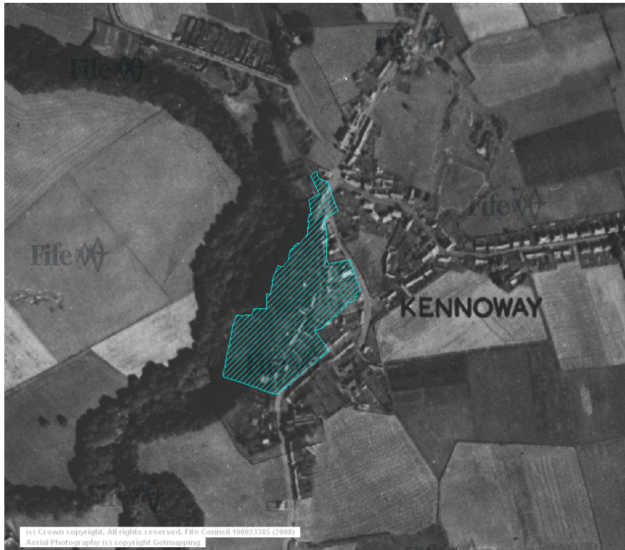
Kennoway from the air in 1940, with The Causeway Conservation Area highlighted in green